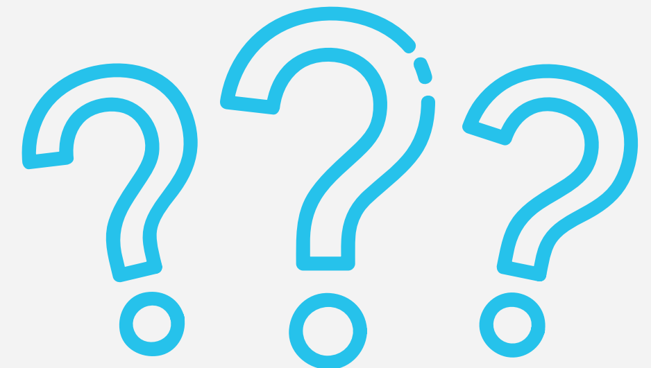
Surprise Unlocks throughout the year