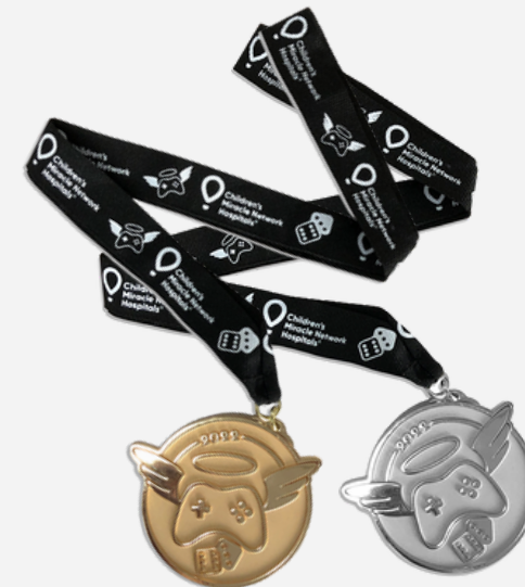
Hero Medals (silver & gold)