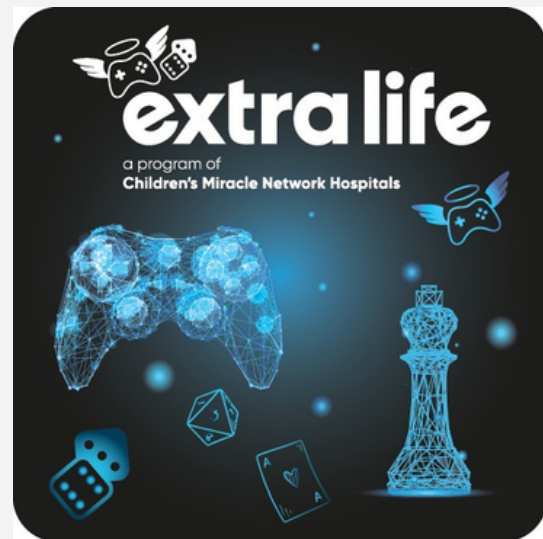
Decal (new design each year)