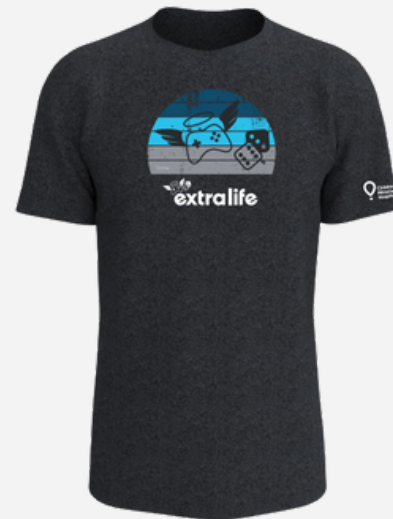
T-Shirt (new design each year)